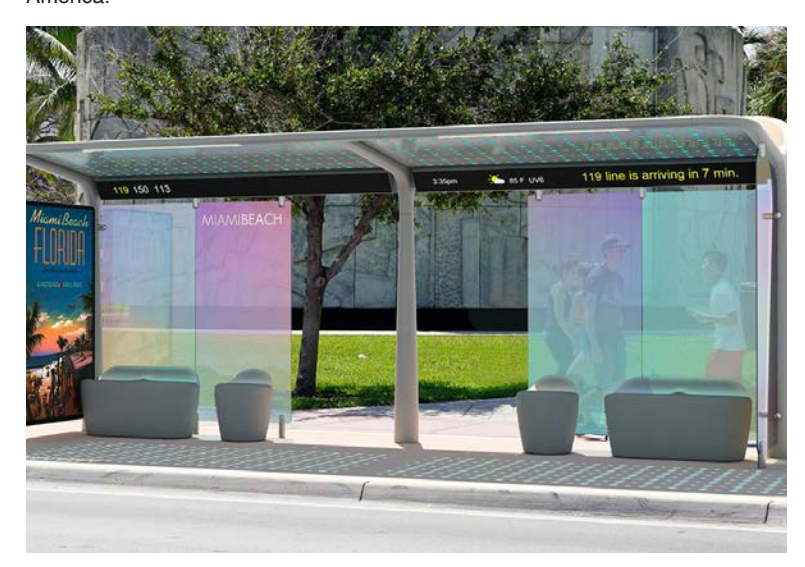
City of Miami Beach Bus Shelters designed by Pininfarina, 2018.