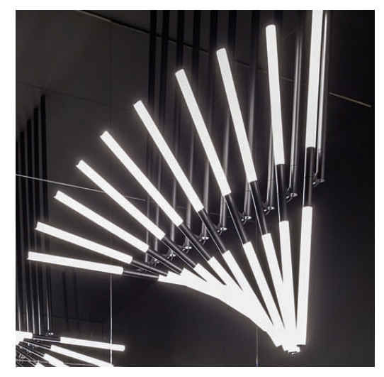
XY180 Light, 2018 by Rem Koolhaus, OMA for Delta Light.