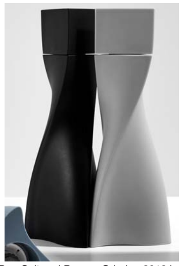
Duo Salt and Pepper Grinder, 2018 by Zaha Hadid.